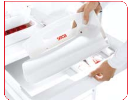
The measuring mat can be rolled up for space-saving storage.